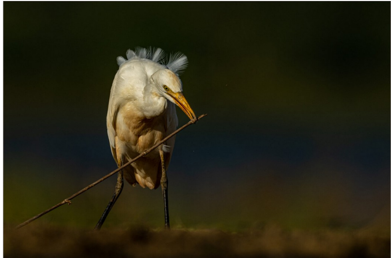
"Nesting material" by Luke Horsten – 51/60 in the Interclub senior category.

In the junior category, for images by photographers up to 3-Star level, which we entered for the first time this year, we ended 29 th out of 44 clubs, and 5 th out of 7 in the Western Cape.