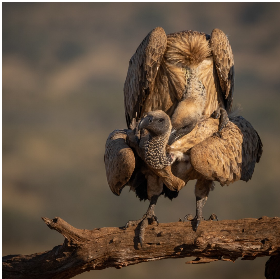
"Vulture passion" by Phil Sturgess, which was awarded a score of 52/60 in the senior category of the 2023 PSSA Interclub competition.

But then, we were the top club in the Western Cape – by a substantial margin.