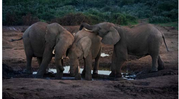
"Lean on me" by Sheron Pretorius, our July junior entry (31/45)

Our July scores place us joint 2 nd among Western Cape clubs in the senior competition (for 4 Star members or higher), and joint 1 st (junior, 3 Star or lower). But nationally we are a more modest joint 15 th and joint 17 th respectively.