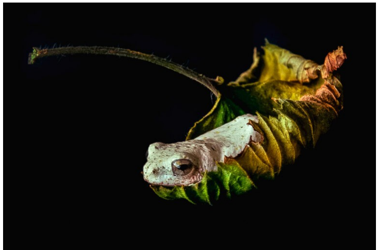
Fourth most popular: "Taking a nap" by René Dewar (23 votes)