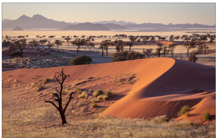
Fifth most popular: "Morning has broken" by Phil Sturgess (22 votes)