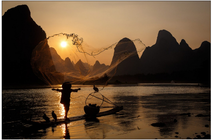
Third most popular: "Daily catch" by Hestie das Neves (30 votes)

All the images can be seen on our website under "Gallery".