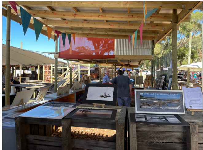
Our club stall at the monthly Art in the Park