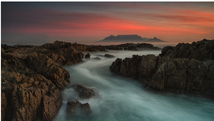
"Sunset Table Mountain" by Crighton Klassen - our club's April entry for the National Senior Club Competition organized by the PSSA