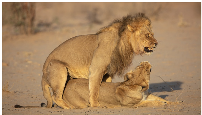
"Dangerous Encounter" by Carina de Klerk, another judge's favourite (72/90).