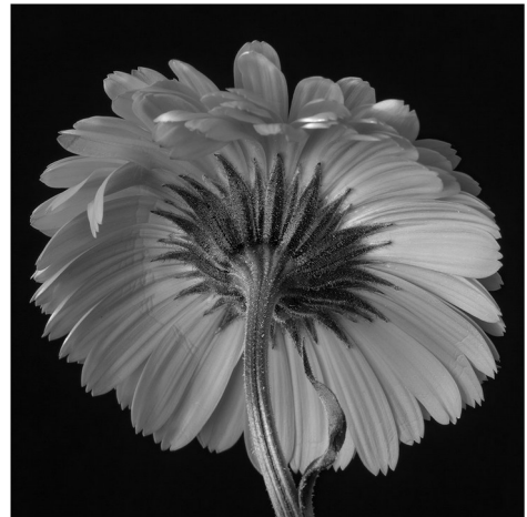
"The Other Side" by Sheron Pretorius, our October entry for the Junior competition (30/45).

For the Western Cape contingent of ten clubs in each competition, October was a good month. Our region's representation in the top twenty of both competitions has increased from four to five clubs. Our club has maintained its position in the Senior competition (4 Star and higher), but dropped down one place in the Junior competition (3 Star and lower).