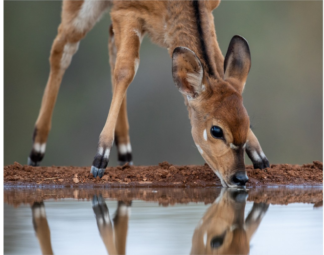
"Bokkie" by Charles Naudé, joint tenth with a score of 75/90.

Secondly, two of the five images chosen by the five judges as their own favourite, were from our club.