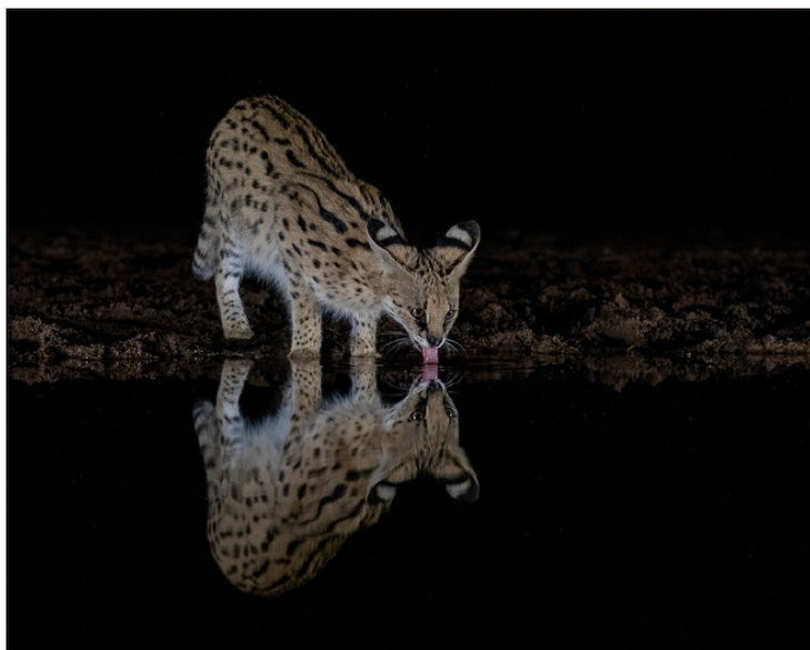
"Tierboskat" by Charles Naudé, runner-up in September in the monthly competition for individual PSSA members

The competition is quite tight. Only 4 points separate the Western Cape Senior leader, Tygerberg (on 110), from the 5 th placed Tafelberg (106). The first placed Junior leader, Fish Hoek (on 113) is 13 points ahead of the fifth placed Hermanus (100).