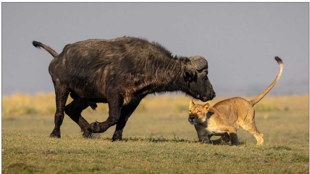
"Fighting Hard" by Phil Sturgess, winner of the Wildlife category in the AFO national digital salon.

This exceptional achievement launched him to the top Western Cape position in the Impala