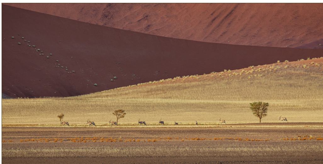
"Sossus Trek" by Phil Sturgess, winner of the Scapes category in the AFO national digital salon.

Including Phil's leading position in the Impala