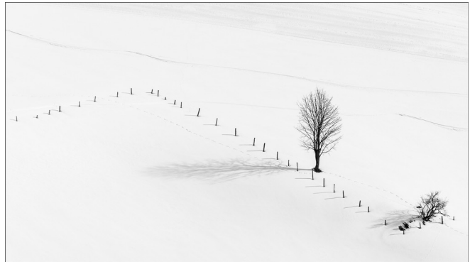
"Winter Tree Zigzag - Merit for Phil Sturgess"