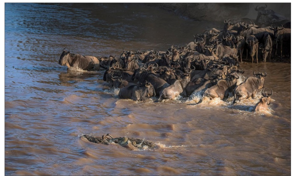
"Frightened" - Gold Medal for Treurnicht du Toit

1 Diploma and 6 acceptances in Rhino Cup Salon