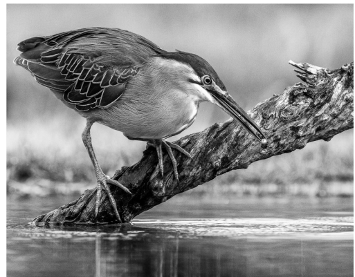
"Titbit" - Merit for Charles Naudé