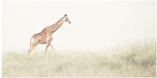
"Giraffe against Horizon" - Merit for Elizma Fourie