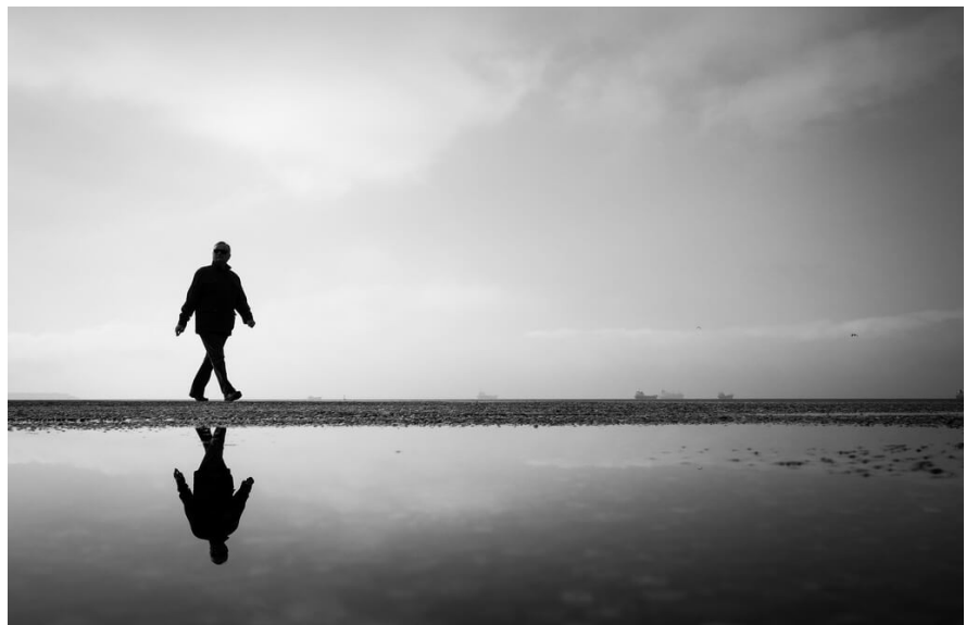
Untitled image by Thomas Leuthard, as an example of minimalism, our club's set subject for June. Members will decide at the meeting on 2 June if the monthly set subject should be opened up to youngsters from our local schools.

The first category is what could be called "mature" juniors. In this case "junior" refers to photographic experience, but not to age. They are regarded as members with a Three-star rating or lower. They are endemic to a town with more mature people like Hermanus, and we have often had