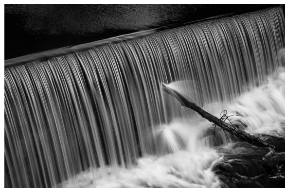
"Vermont Cascade" - Merit for Phil Sturgess