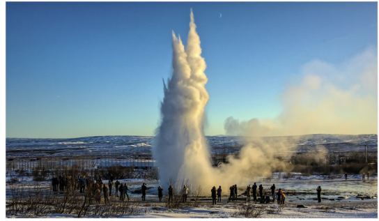
PSA Gold Medal for "Strokkur Erupts" at the Kaalboisakhi International India Salon