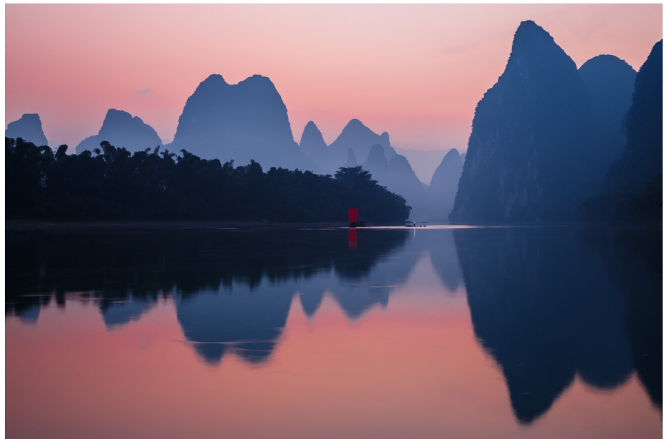
"Morning Bliss", a night landscape in Hestie das Neves's successful portfolio

"It was so nice to receive the good news after that bad fracture which put a stop to all my plans for working on