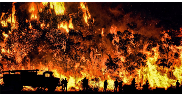
FIP Ribbon for "Conflagration Hermanus" at the First Impressions Salon in India