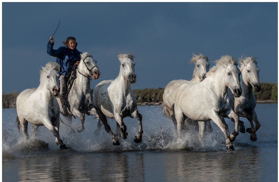
"White Horses of Camargue", action in Hestie's successful portfolio