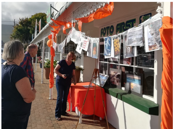
Preparations for our December First Friday exhibition

"Club activities included our fourth FynArts Print Exhibition in June; participation in the monthly First Friday Art Walk; participation in the Western Cape Interclub Photographic competition in October; and participation in the monthly