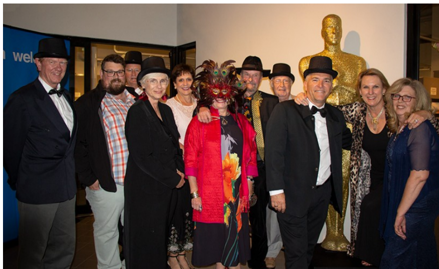
Our club members hosting the Interclub

"We also had an interactive session on layers in Photoshop.