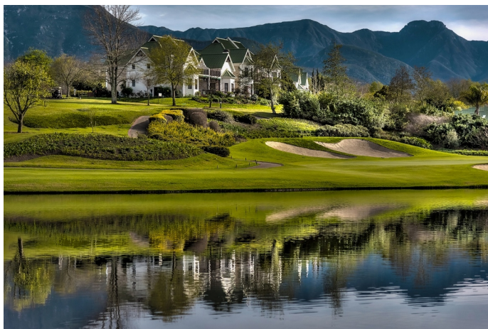
"South African Golf Estate" by Treurnicht du Toit – Certificate of Merit in Optics International Photo Contest.

Treurnicht du Toit – Merit + 2 acceptances