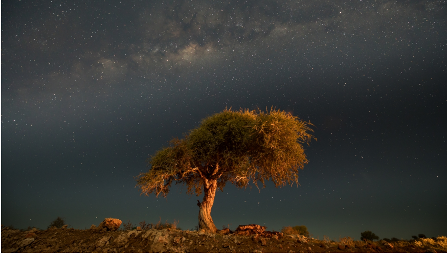
Second place: "By Moonlight" by Diane Steenkamp (19 votes, 6% of the total)