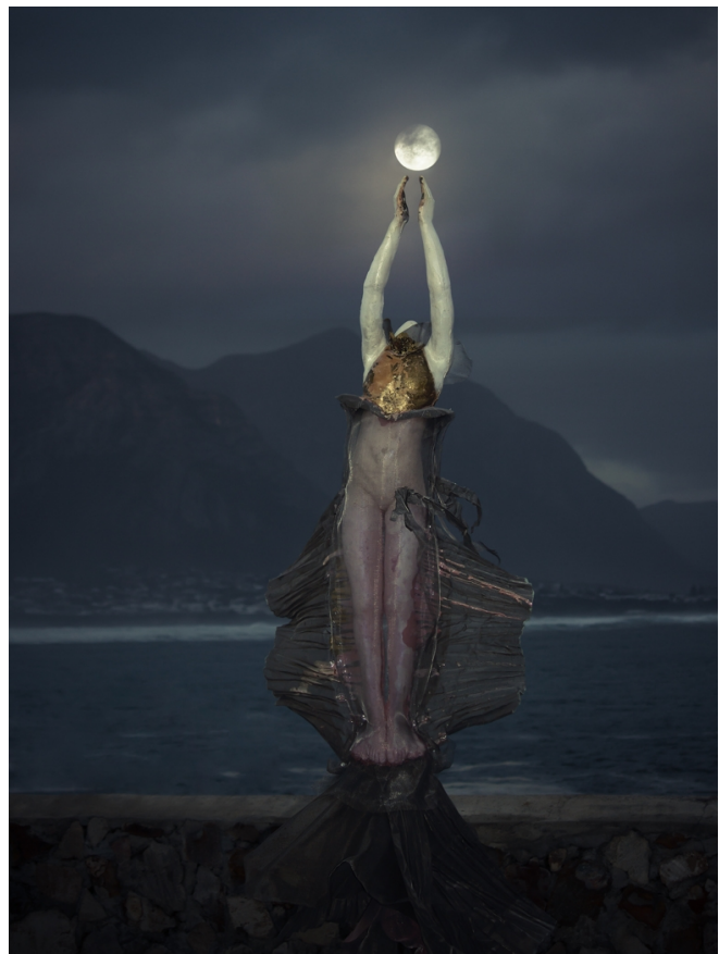
Most popular, "Reach for the Stars" by Elizma Fourie

As in the past, many visitors complimented us on the general quality of our photography. This was borne out by the wide spread of votes, with 53 of the 69 images receiving at least one vote. Even the most popular print received only 29 votes, or 8% of the total.