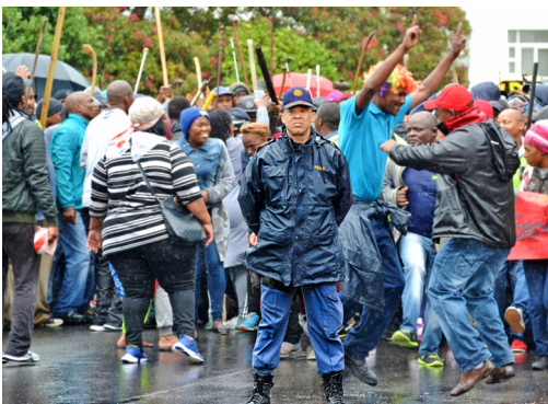
Fifth: "Crowd Control" by Taylum Meyer (14 votes, 4%)