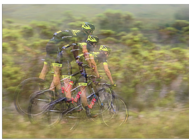
The winner: Treurnicht du Toit's "Triplicity".

The new format of our club's set subject was applied at the April meeting. It is a combination of two formats that have been used in recent years. The set subject was "Movement", depicted by using multiple exposure, in-camera or in post-processing.