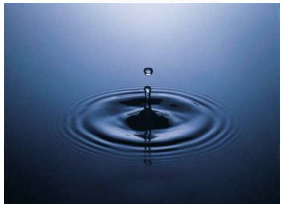
A plunging water drop

The Set Subject for July will be "Light, camera, action". It can accommodate images from the FynArts festival from 9-18 June, and other kinds of action, especially where light plays an important role. That includes images of plunging water drops, a subject on which Elizma Fourie will present a workshop on Thursday 22 June.