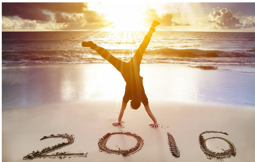
An example of a "New year's resolutions" image - from the internet.

The theme will be "New year's resolutions".