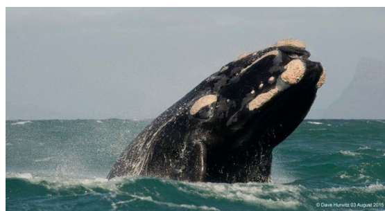
A Southern Right Whale, the icon of Hermanus. But there is much more to photograph in the town.

There will be no open evaluation or set subject for the month.