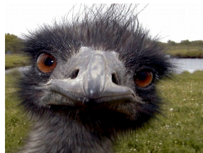
The face of an Emu.

Emus have long necks, sharp beaks and small ears. They have two sets of eyelids, one for blinking and one to keep out dust. Their feet are long, with three toes. One toe on each foot has a long talon, for fighting.