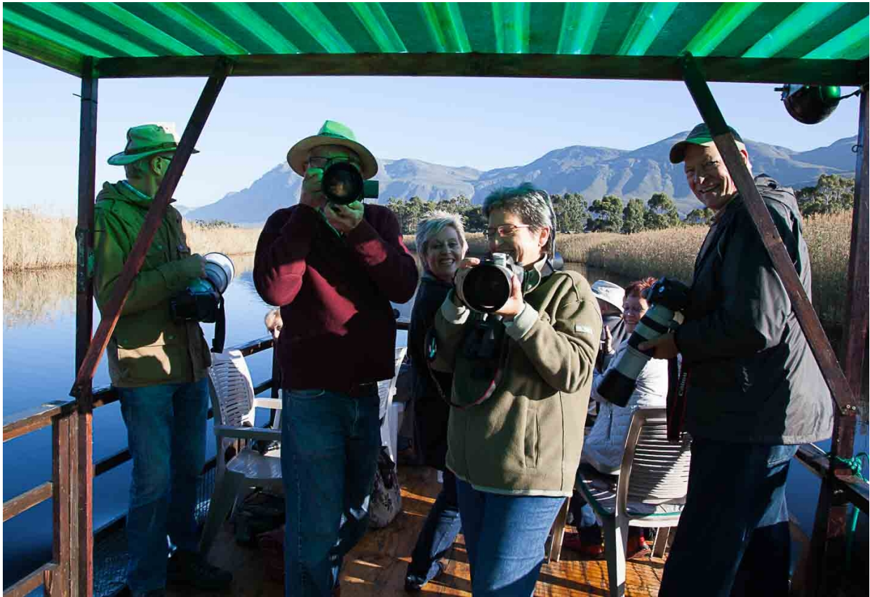
Society members on board the River Rat on the early morning cruise down the Klein River at Stanford on Sunday 24 April, appropriately equipped for bird photography. The beautiful light and scenery offered opportunities for focusing on more than just birds.